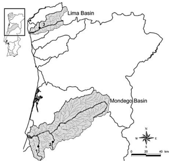
Figure 1. Map of the study area, showing the location of the Arunca (1), Corvo (2) and Estorãos (3) rivers. Mapa del área de estudio, mostrando la localización de los ríos Arunca (1), Corvo (2) y Estorãos (3).

The ruivaco Achondrostoma oligolepis (Robalo, Doadrio, Almada & Kottelat, 2005) is a small-sized (< 150 mm TL) cyprinid endemic to Portuguese rivers. Its distribution covers the central and northern river basins of Portugal, occupying a great variety of lotic systems from cold-water and permanent streams to warm-water and intermittent watercourses (Ferreira et al. , 2007a). This species normally inhabits moderate to slow-flowing waterways with sandy or gravel substratum and aquatic vegetation and is generally considered tolerant to stream degradation (Santos et al. , 2004; Ferreira et al. , 2007b). It reaches sexual maturity in the second year of life and reproduces from April to June. There are studies that focus on the genetic variability (Robalo et al. , 2007) and spatial distribution of this species at different spatial scales (Ferreira et al. , 2007a), but none have addressed feeding ecology. This information could prove extremely useful for other small